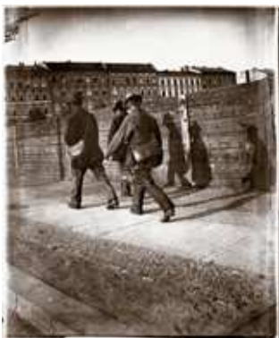
3) Heinrich Zille: Charlottenstraße, Berlin 1898. From: Heinrich Zille, Photographien Berlin 1890-1910