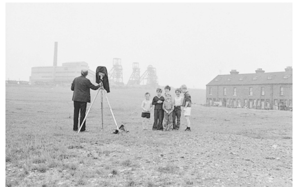
5) Hilla Becher: Bernd Becher taking photographs in the North England mining area, 1968. From: Susanne Lange: Bernd und Hilla Becher. Leben und Werk