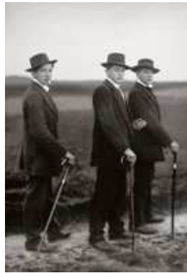
1) August Sander: Young farmers, 1914. From: August Sander, Menschen des 20. Jahrhunderts