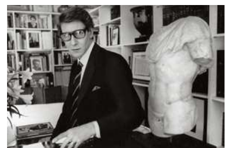
26) Yves Saint Laurent, ca. 1988. In the background: the Schirmer/Mosel publication Joseph Albert - Hofphotograph der Bayerischen Könige.