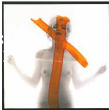
4) Bert Stern: Marilyn Monroe, The Last Sitting, Los Angeles 1962. From: Marilyn Monroe/ Bert Stern, The Last Sitting