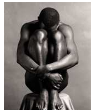
8) Robert Mapplethorpe: Ajitto, 1981. From: Robert Mapplethorpe, The Black Book