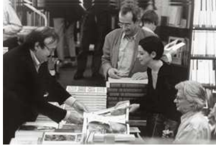
28) Book signing with Richard Avedon (right), Cologne 1986