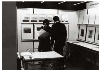
22) First Frankfurt Book Fair booth, 1974.