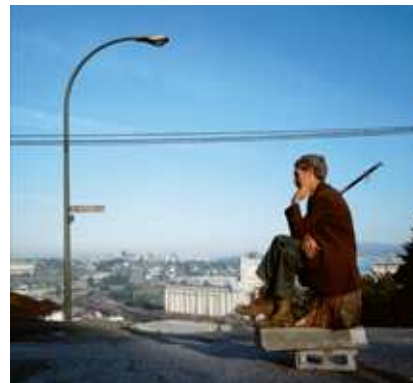
2) Jeff Wall: The Thinker, 1986.