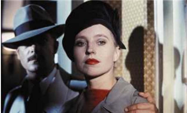
9) Hanna Schygulla, in: Lili Marleen , 1981. From: Du ... Augen wie Sterne. Das Hanna Schygulla Album