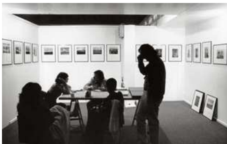
21) Schirmer/Mosel booth, Art Basel, 1974. Photo: Beat Wyss