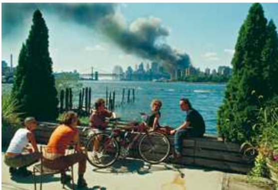
12) Thomas Hoepker: View from Williamsburg towards Brooklyn Bridge and downtown Manhattan, 11 th September 2001. Book cover of: Thomas Hoepker, Photographien 1955-2005