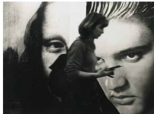
13) Barbara Klemm: Between Leonardo and Elvis, Schirmer/Mosel booth on the 2002 Frankfurt Book Fair