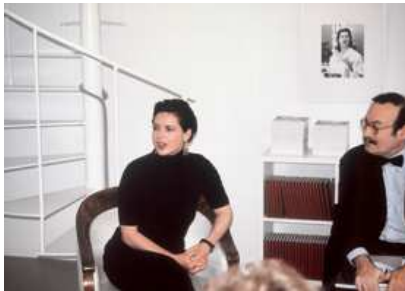
30) Isabella Rossellini and Lothar Schirmer, Schirmer/Mosel Showroom, Munich 1999