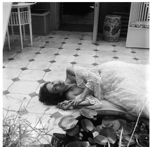
11) Bianca Jagger, Reddish House, 1978