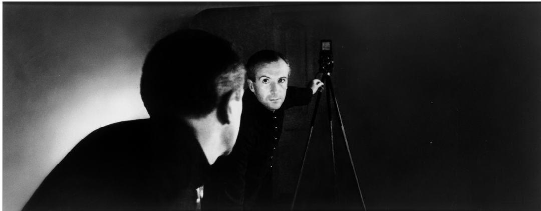
9) Cecil Beaton, self portrait, 1938