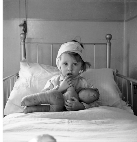
8) Eileen Dunne, 1940 Cover image Life , September 23, 1940