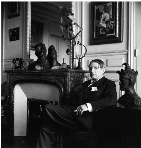
4) Pablo Picasso, 1933