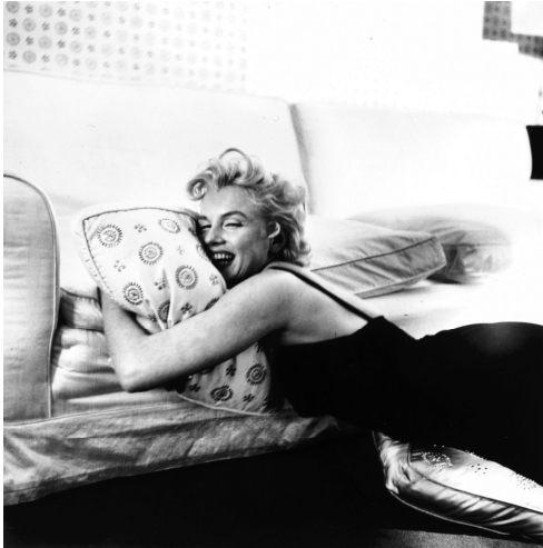
7) Marilyn Monroe, 1956