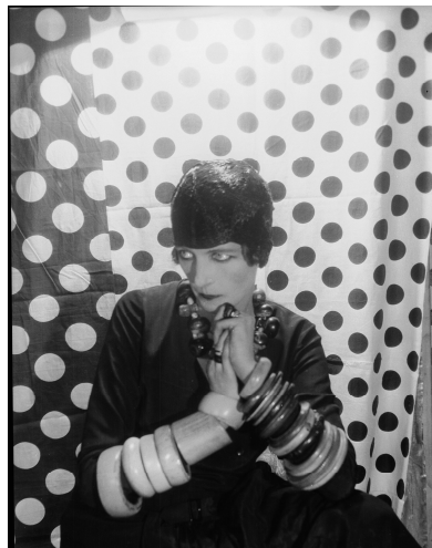
5) Nancy Cunard, late 1920s