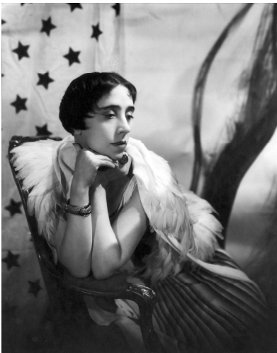
1) Elsa Schiaparelli, 1930s