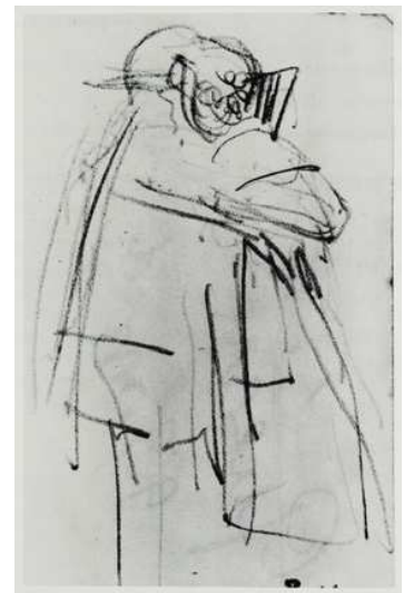
3) The Embrace , 1910 Pencil on paper