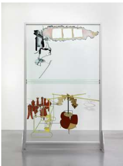
4) The Bride Stripped Bare by her Bachelors, Even (Large Glass) , 1915-23