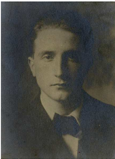
1) Marcel Duchamp, Munich, 1912