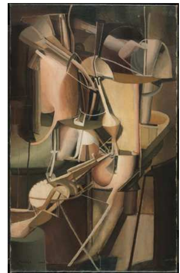
7) Bride , 1912, Oil on canvas (Philadelphia Museum of Art)