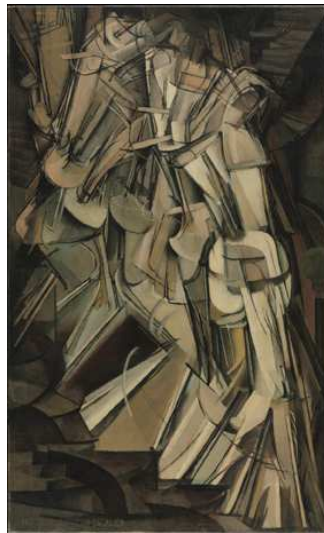
2) Nude Descending a Staircase no. 2 , 1912, Oil on canvas (Philadelphia Museum of Art)