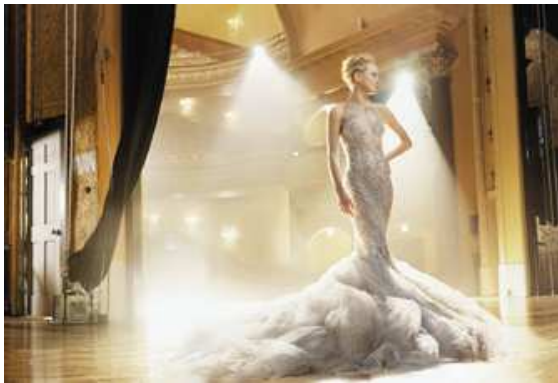
9 Nicole Kidman, New York, 2003