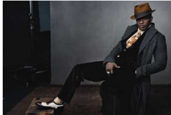
8 Jamie Foxx, Culver Studios, Culver City, California, 2004