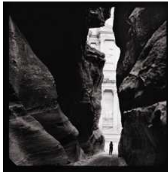
1 Susan Sontag, Petra, Jordan, 1994