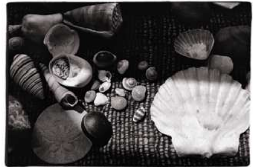
2 Susan's shell collection, King Street sunporch, New York, 1990