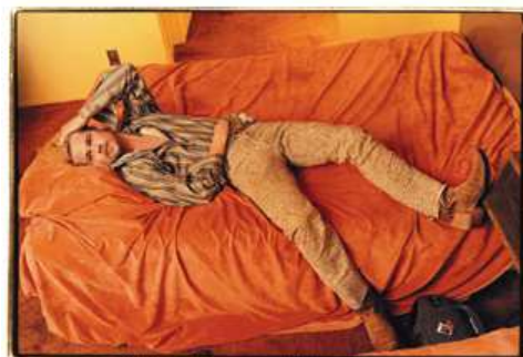
6 Brad Pitt, Las Vegas, 1994