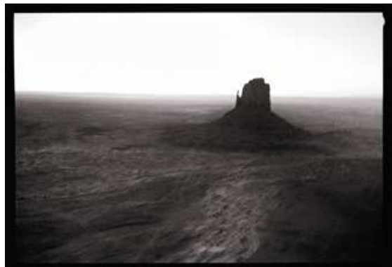
14 Monument Valley, Arizona, 1993