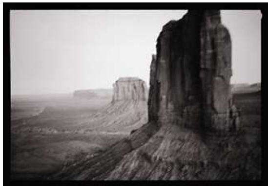
13 Monument, Valley, Arizona, 1993