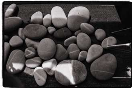
10 Susan's collection of stones, King Street sunporch, New York, 1990