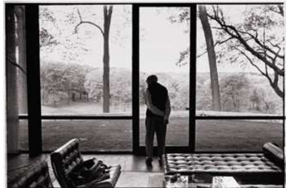
12 Philip Johnson, Glass House, New Canaan, Connecticut, 2000