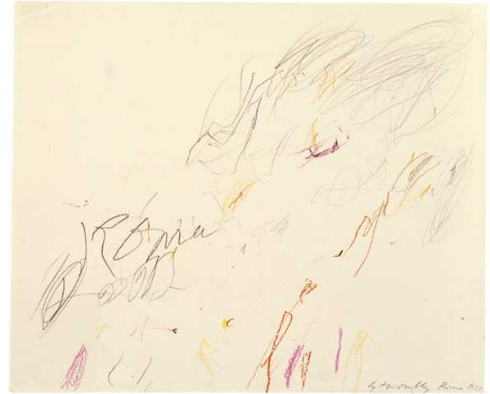
6. Cat. No. 73, Untitled, 1958, Rome Wax crayon, pencil