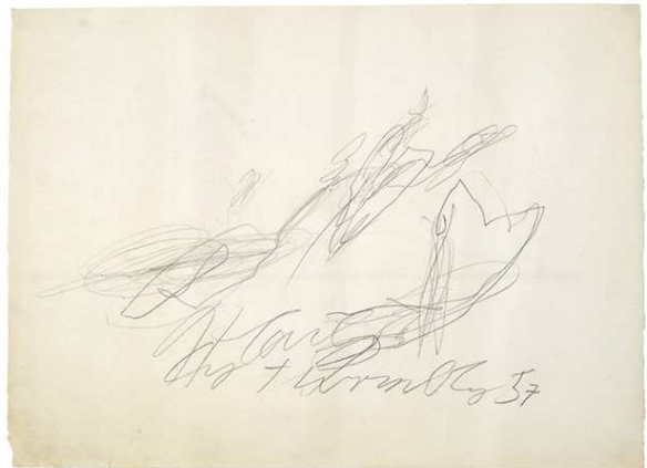
2. Cat. No. 27, Untitled, 1957, Rome Pencil