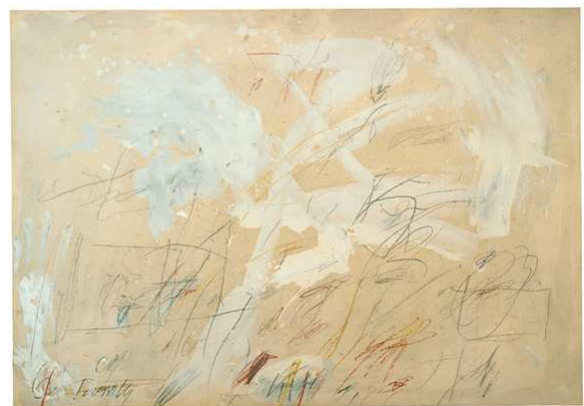
4. Cat. No. 58, Untitled, 1957, Rome Oil-based house paint, pencil, wax crayon