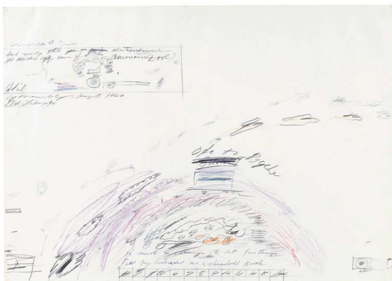
9. Cat. No. 199, Ode to Psyche, August 1960, Sant'Angelo, Ischia Pencil, wax crayon, ballpoint pen