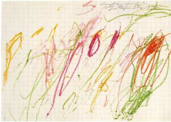
5. Cat. No. 61.VI, Untitled, 1957, Grottaferrata Wax crayon, pencil on grid paper