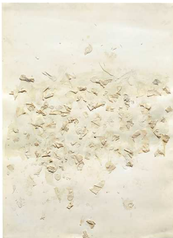
7. Cat. No. 160, Sperlonga Collage, 1959, Sperlonga Collage: (irregularly torn and folded semi-transparent glassine paper shreds), oil-based house