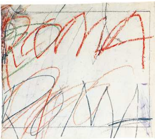
3. Cat. No. 34, Untitled, 1957, Rome Gouache, wax crayon, pencil on irregularly cut cardboard