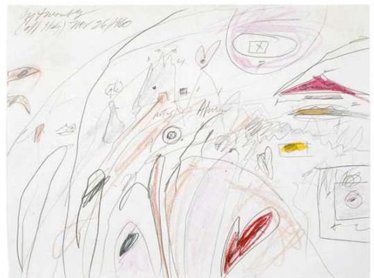
10. Cat. No. 227, Untitled (off Italy), November 26, 1960, Aboard the SS Leonardo da Vinci from New York to Naples Wax crayon, pencil